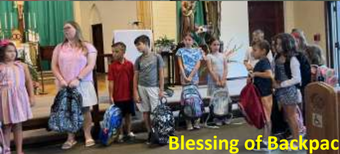
Blessing of Backpack