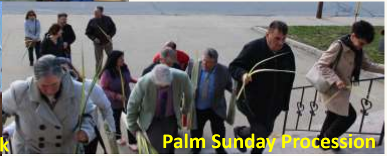
Palm Sunday Procession