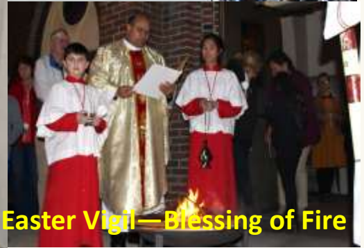
Easter Vigil—Blessing of Fire