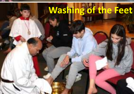
Washing of the Feet