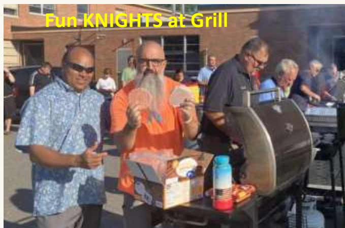
Fun KNIGHTS at Grill

Performing my duties among Christian men brought me joy and a sense of belonging. I remarked to my Brothers how I had never seen so many men who looked so entirely different in their manner and presentation from all walks of life, ages late teen to late 80s!