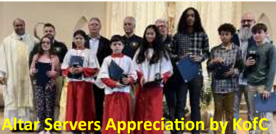
Altar Servers Appreciation by KofC