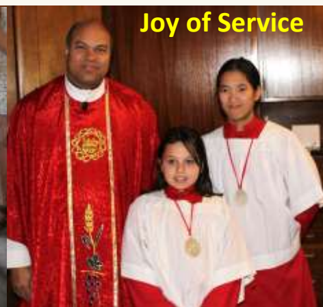
Joy of Service