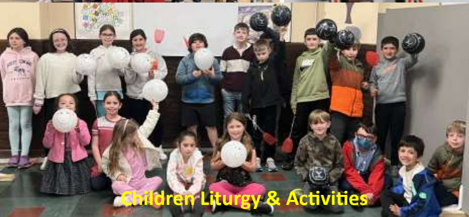
Children Liturgy & Activities